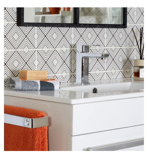
Monochrome Border Gloss 200 x 100mm

N.B For full product and technical information for this or any of our other ranges, please contact our customer services helpline +44 (0) 1782 524 000 or visit our website - www.johnson-tiles.com