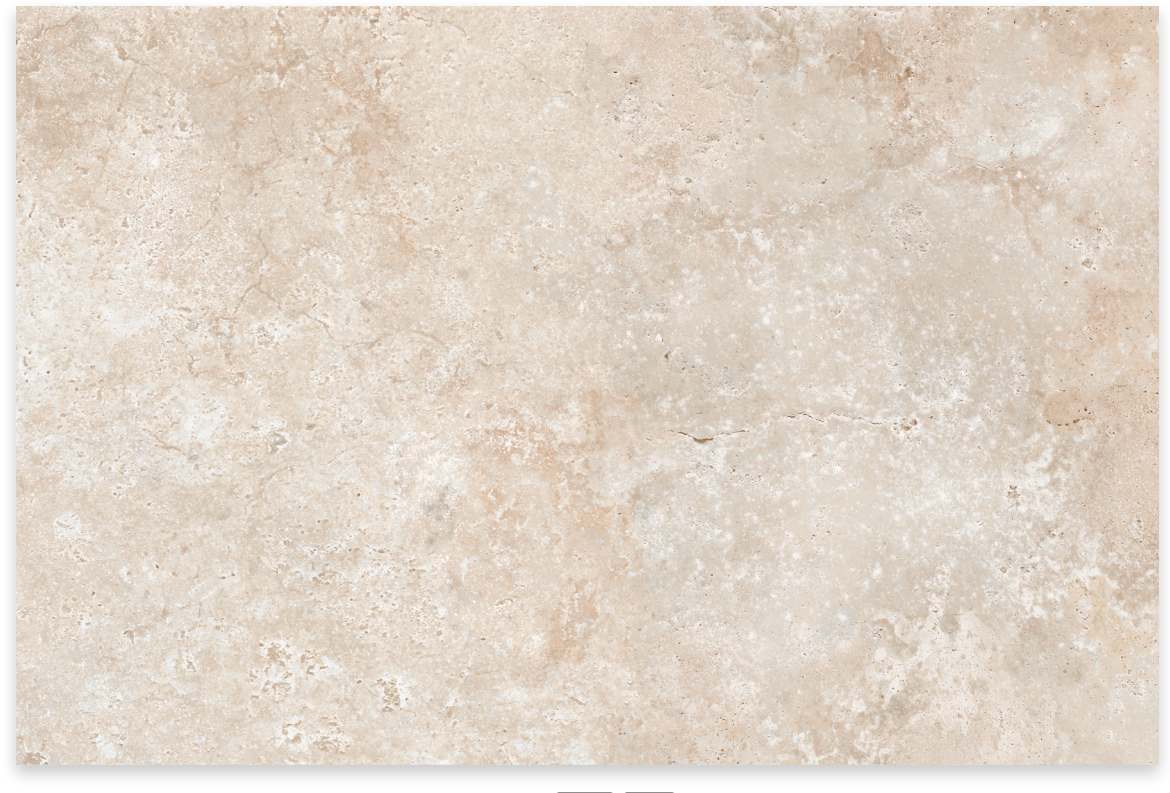
OAT LRV: 40 PEI: III

Product Code - 900x900mm, 760x760mm & 610x610mm: E ZAZ01E 2cm