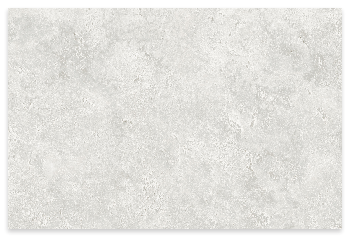
PERLA LRV: 50 PEI: IV

Product Code - 1200x600mm, 900x900mm, 900x450mm, 750x750mm, 610x610mm & 610x300mm: © ZAZ01G