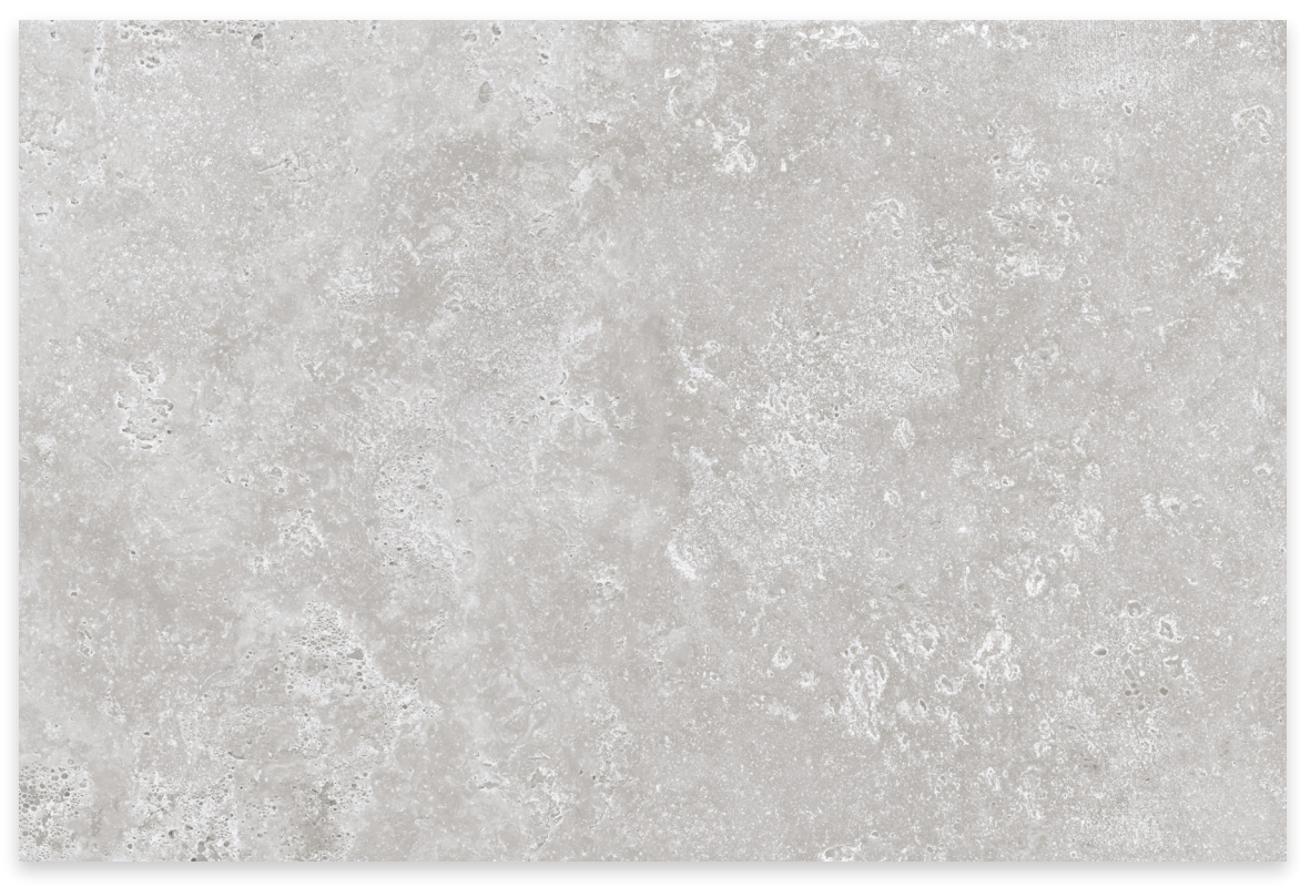
STEEL LRV: 38 PEI: III

Product Code - 900x900mm, 760x760mm & 610x610mm: E ZAZ03E 2cm