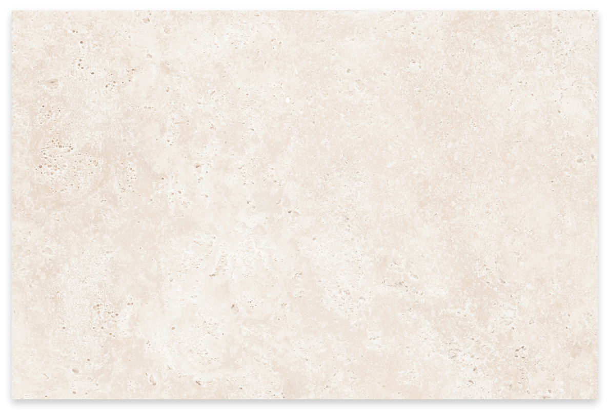
SAND LRV: 53 PEI: III

Product Code - 1200x600mm, 900x900mm, 900x450mm, 750x750mm, 610x610mm & 610x300mm: © ZAZ03G