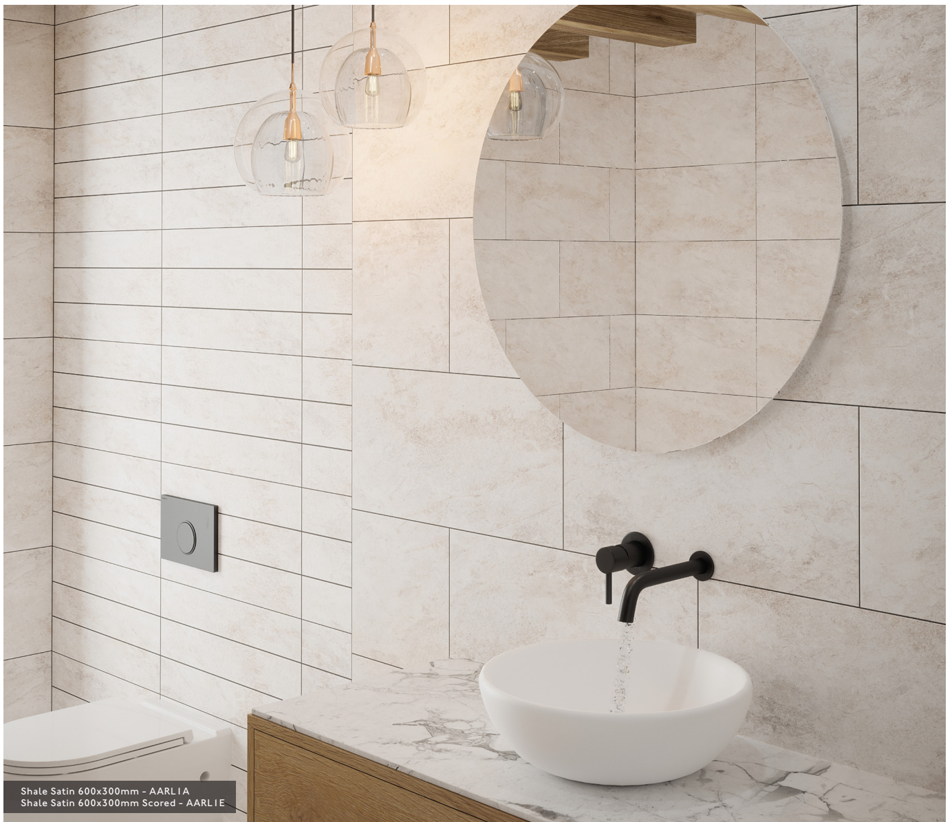
Shale Satin 600x300mm - AARLIA Shale Satin 600x300mm Scored - AARLIE