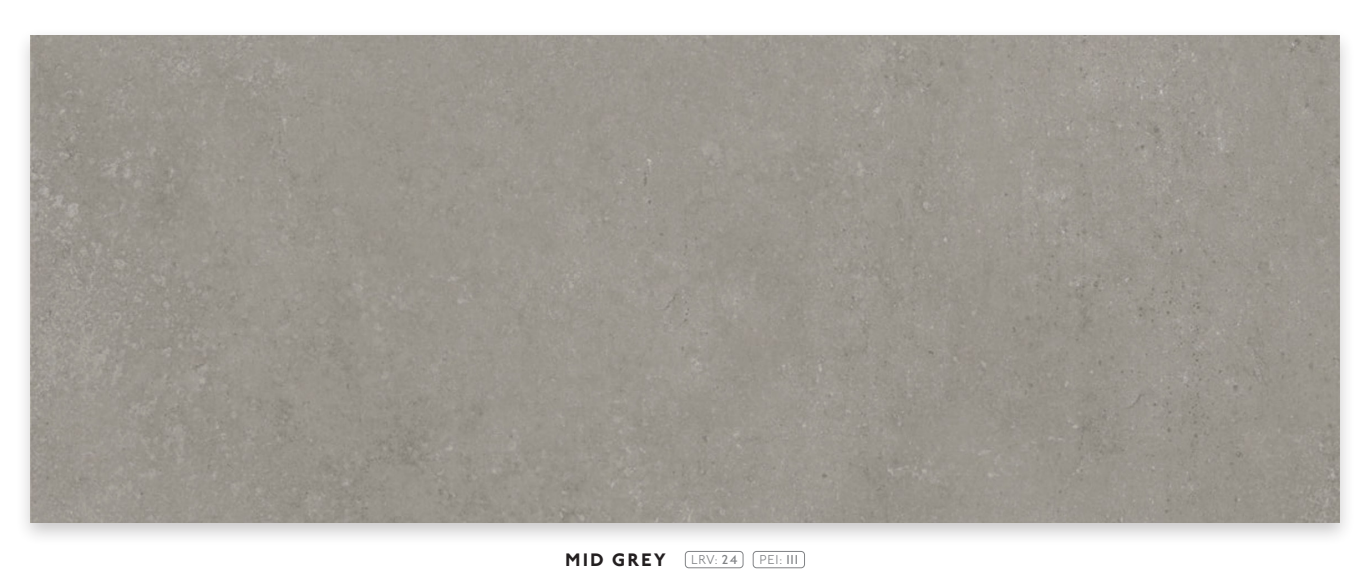
Product Code - 600x600mm & 450x450mm [Bla]: M CTO4F