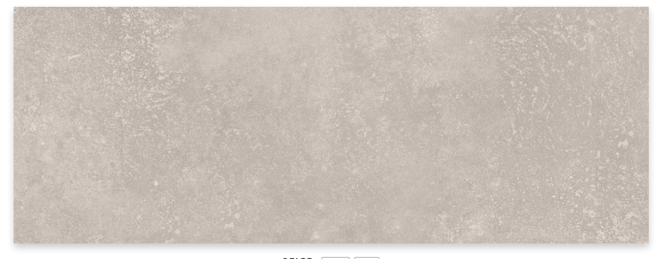
BEIGE LRV: 54 PEI: III Product Code - 450x250mm [BIII]: S CITS2A | Product Code - 600x600mm & 450x450mm [BIa]: M CTO2F