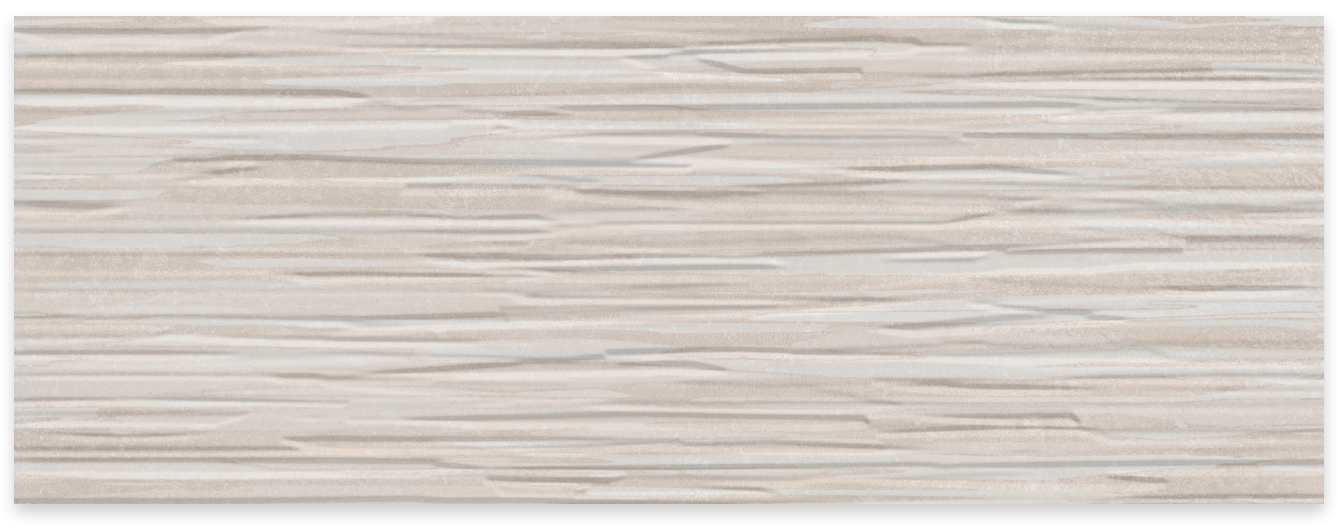
BEIGE LINEAR MIX (Linear Structure) Product Code - 450x250mm [BIII]: S CITS2L