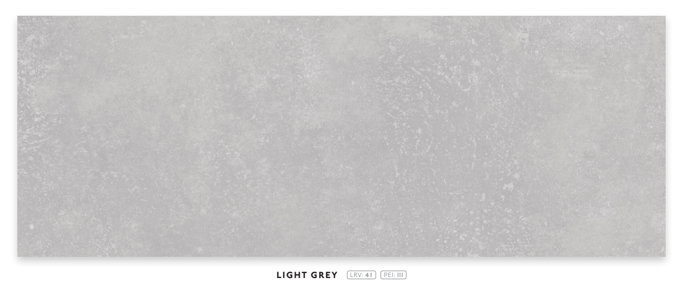
Product Code - 450x250mm [BIII]: S CITS3A | Product Code - 600x600mm & 450x450mm [BIa]: M CTO3F