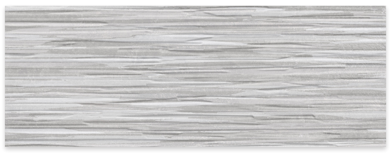
GREY LINEAR MIX (Linear Structure) Product Code - 450x250mm [BIII]: (S) CITS IL