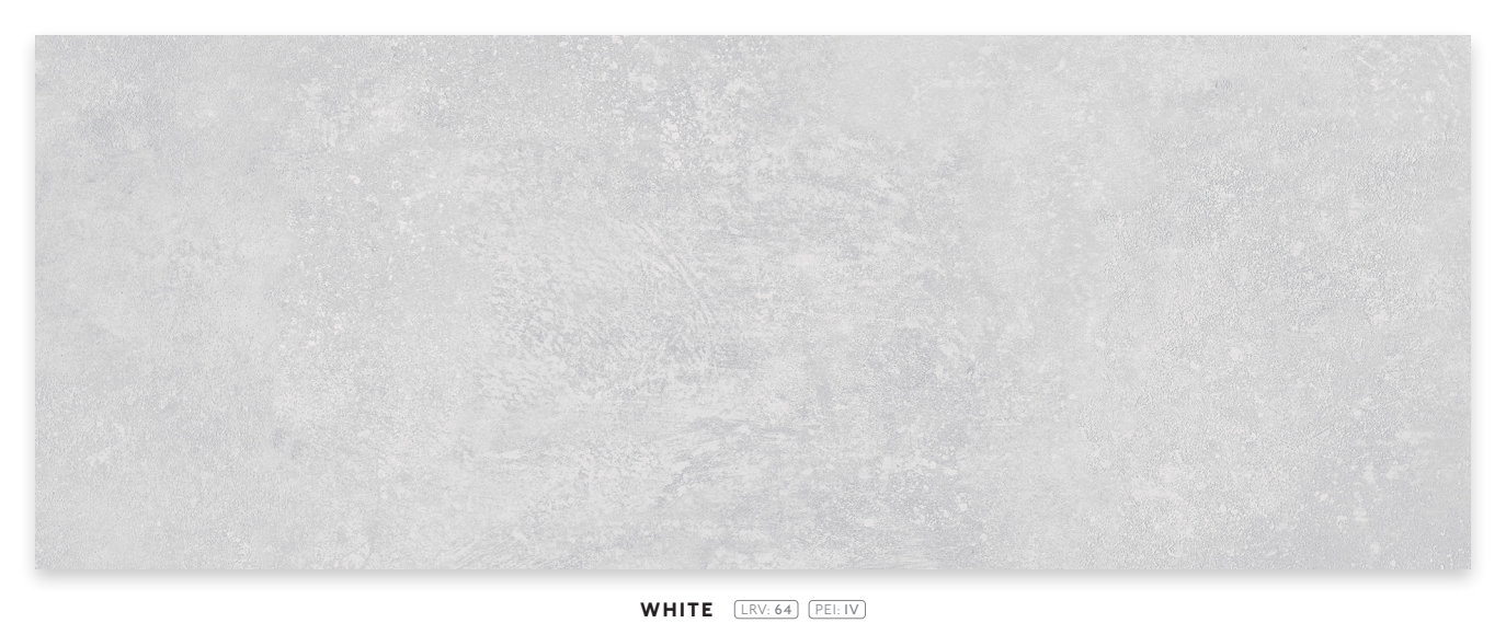
Product Code - 450x250mm [BIII]: 3 CITS1A | Product Code - 600x600mm & 450x450mm [BIa]: M CTO1F