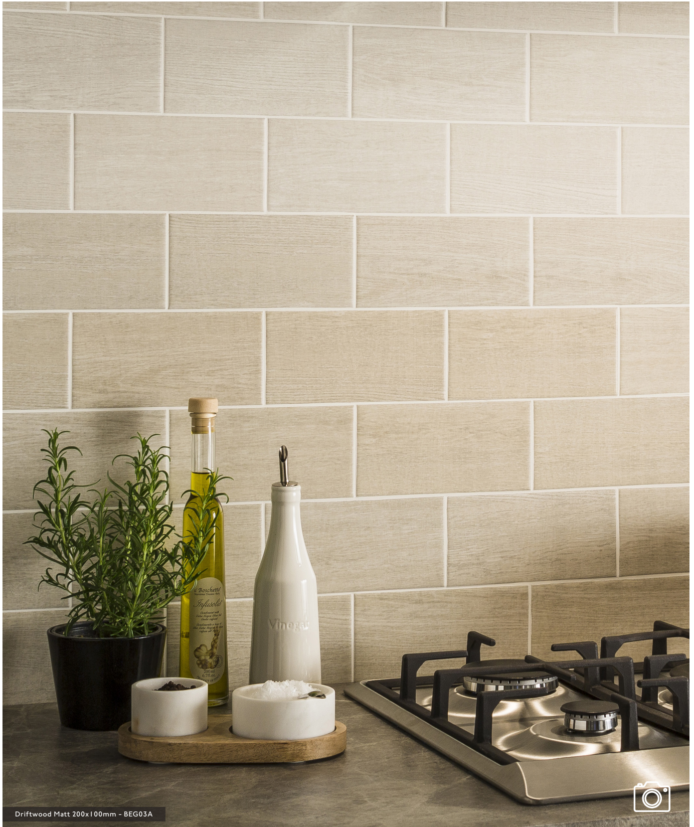
Driftwood Matt 200x100mm - BEG03A

Front Cover Image: BEG01A & Driftwod Matt 200x100mm - BEG03A