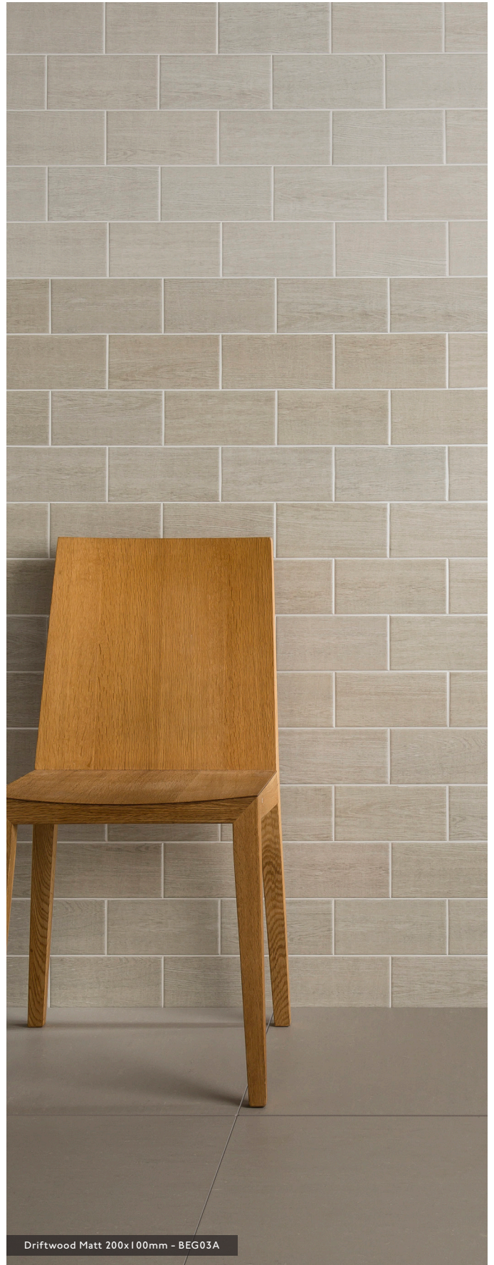
Driftwood Matt 200x100mm - BEG03A