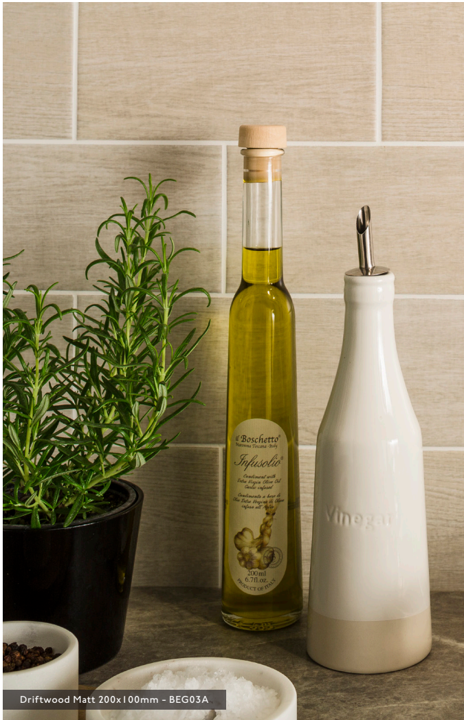
Driftwood Matt 200x100mm - BEG03A