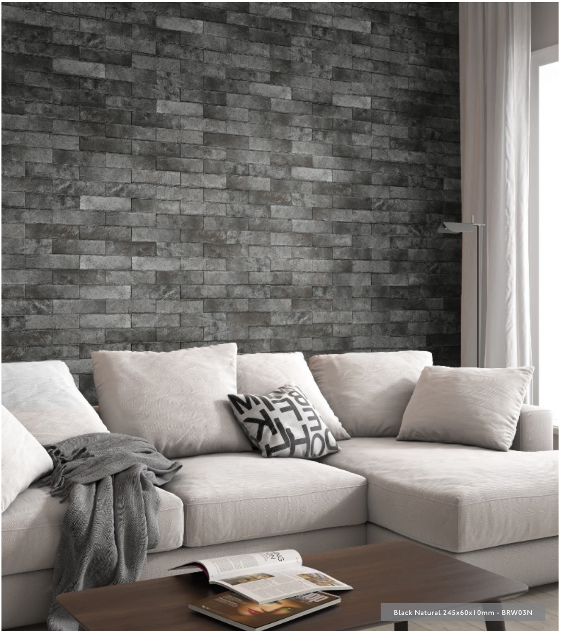
Black Natural 245x60x10mm - BRW03N

Note: Glazed Porcelain [Bla] tiles. For more information please see the suitability advice given in the technical section. All sizes indicated are metric modular. All sizes shown are nominal. For the most up-to-date size, colour and finish availability, please visit our website - www.johnson-tiles.com .