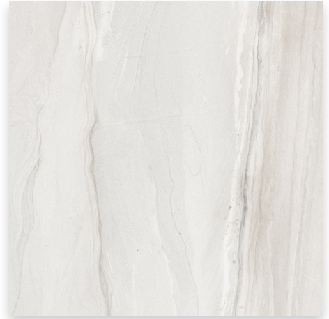
SAND G HAVE1F PEI: III LRV: 62