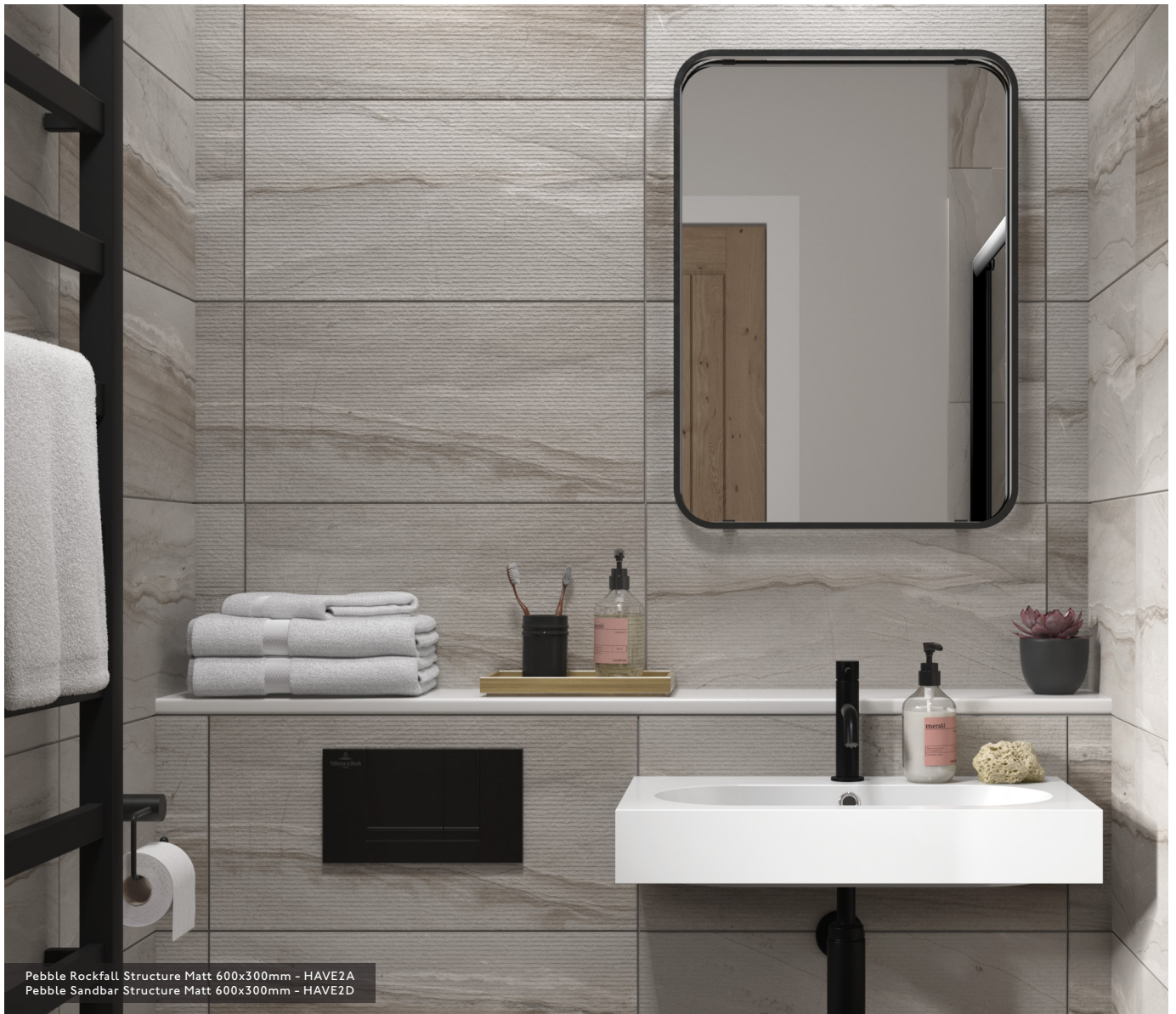
Pebble Rockfall Structure Matt 600x300mm - HAVE2A Pebble Sandbar Structure Matt 600x300mm - HAVE2D