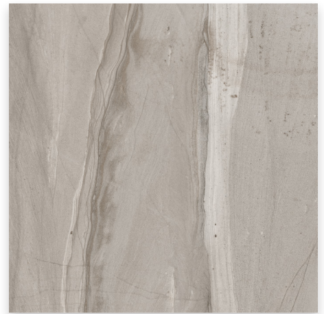
PEBBLE G HAVE2F PEI: II LRV: 35