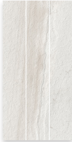
SAND SCORED ROCKFALL STRUCTURE M HAVE1E LRV: 62