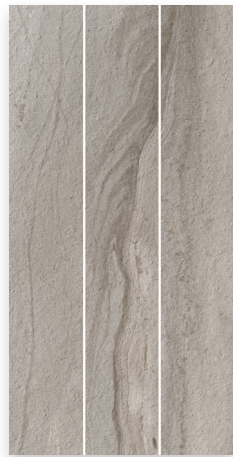
PEBBLE SCORED ROCKFALL STRUCTURE M HAVE2E LRV: 35