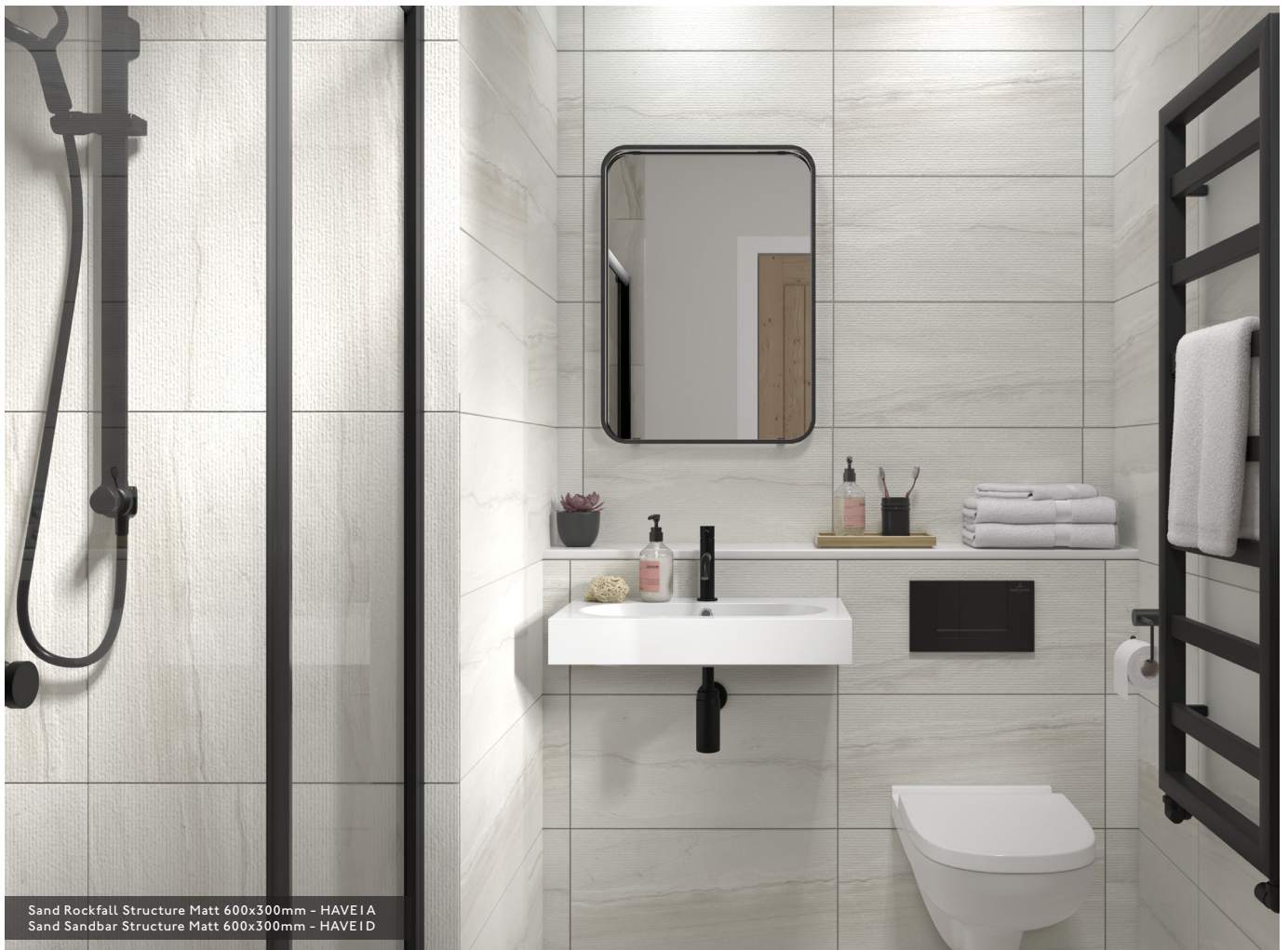
Sand Rockfall Structure Matt 600x300mm - HAVE I A Sand Sandbar Structure Matt 600x300mm - HAVE I D

Note: All sizes indicated are metric modular. All dimensions are in millimetres. All sizes shown are nominal. For the most up-to-date availability information, please visit our website. All LRV results are from Johnson Tiles' internal test reports and are to be used for guidance only. LRV: Light Reflectance Value.