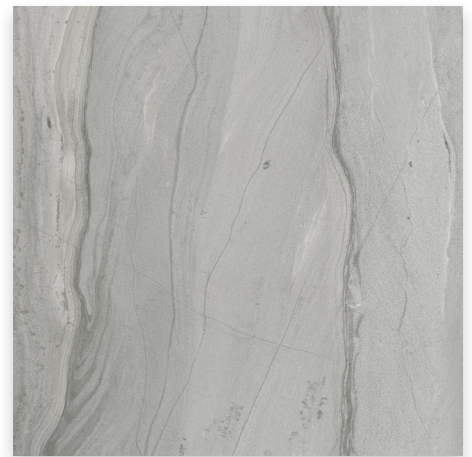
SLATE G HAVE3F PEI: II LRV: 40