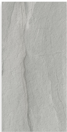
SLATE ROCKFALL STRUCTURE M HAVE3A LRV: 40