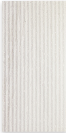
SAND SANDBAR STRUCTURE M HAVE1D LRV: 62