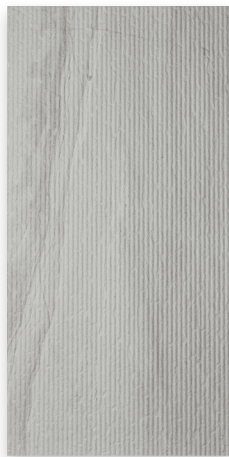
SLATE SANDBAR STRUCTURE M HAVE3D LRV: 40