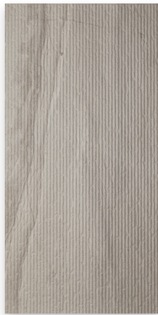
PEBBLE SANDBAR STRUCTURE M HAVE2D LRV: 35