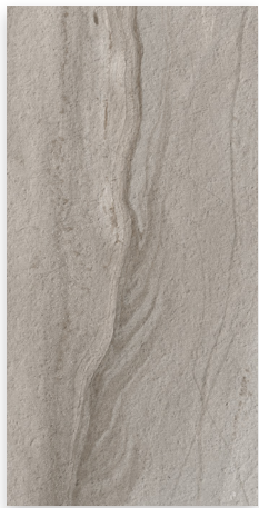
PEBBLE ROCKFALL STRUCTURE M HAVE2A LRV: 35