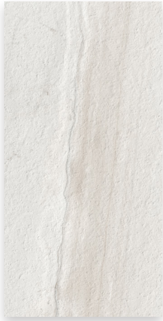
SAND ROCKFALL STRUCTURE M HAVE1A LRV: 62