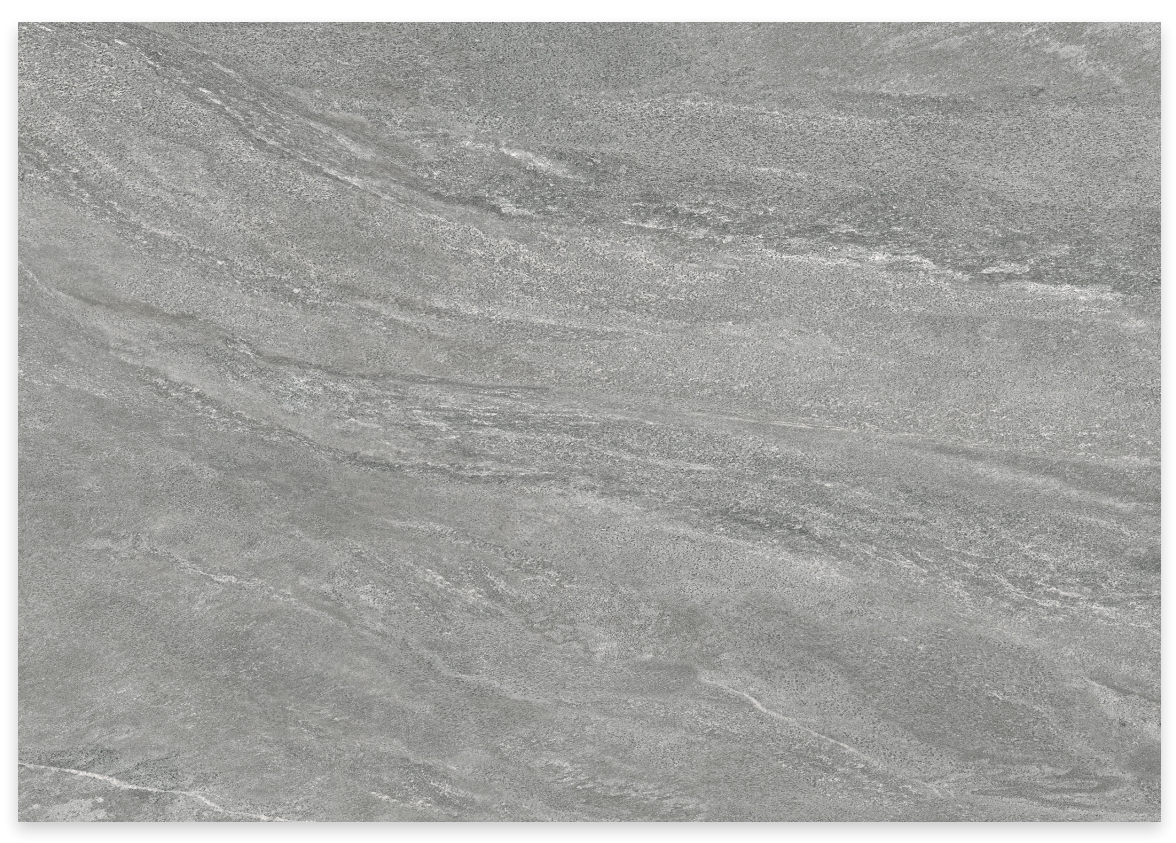
GREY (LRV: 38) (PEI: III) Product Code - All Sizes: G ZRC03G