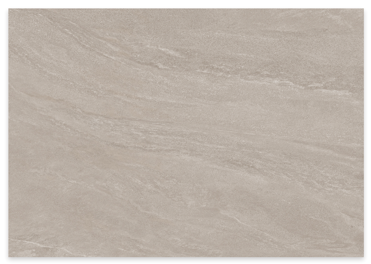
BEIGE LRV: 43 (PEI: III) Product Code - All Sizes: G ZRC02G