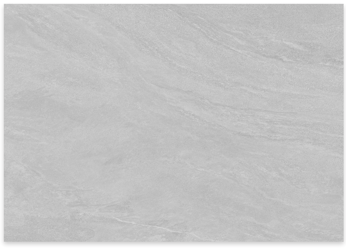
IVORY (LRV: 54) (PEI: IV) Product Code - All Sizes: G ZRCOIG