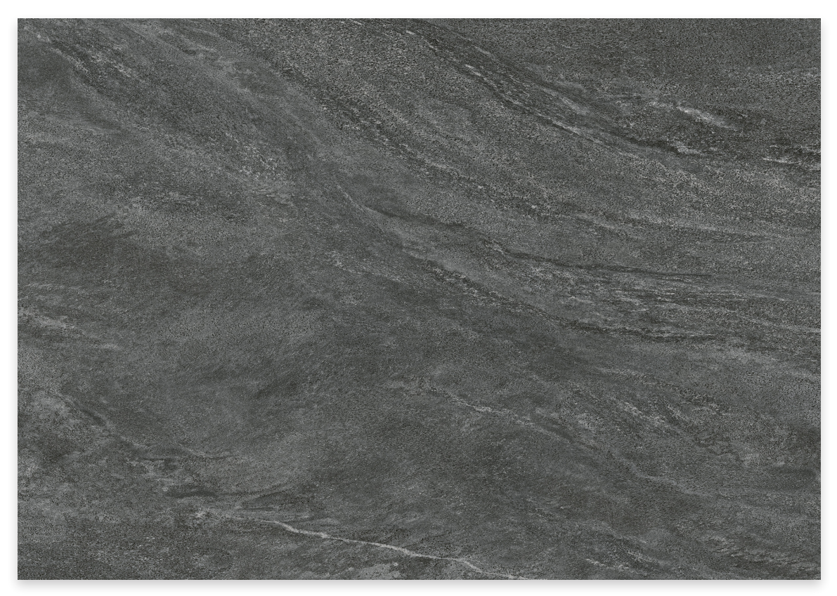
CHARCOAL (LRV: 21) (PEI: III) Product Code - All Sizes: G ZRC04G