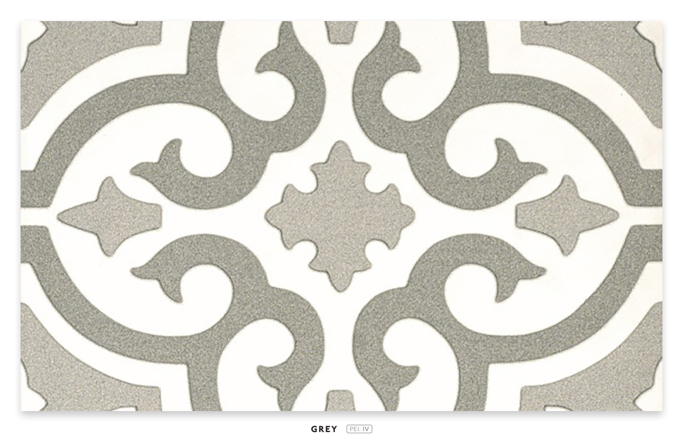
Product Code - 330x330mm [Bla]: N DRW04N