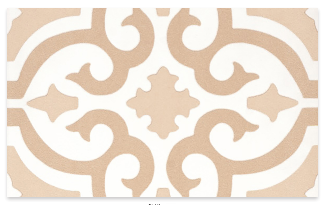
CLAY PEI: IV Product Code - 330x330mm [Bla]: N DRW01N