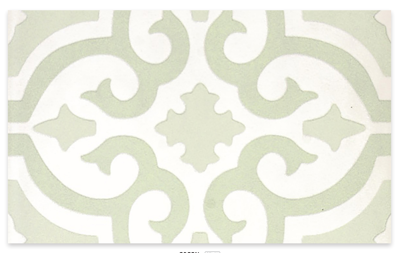
GREEN PEI: IV Product Code - 330x330mm [Bla]: N DRW03N