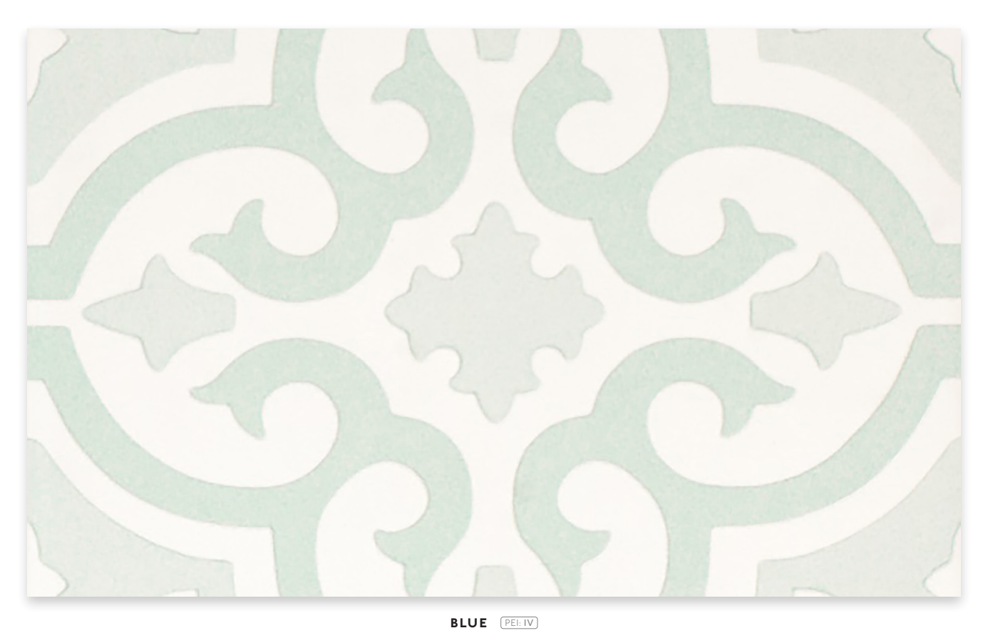
Product Code - 330x330mm [Bla]: N DRW02N