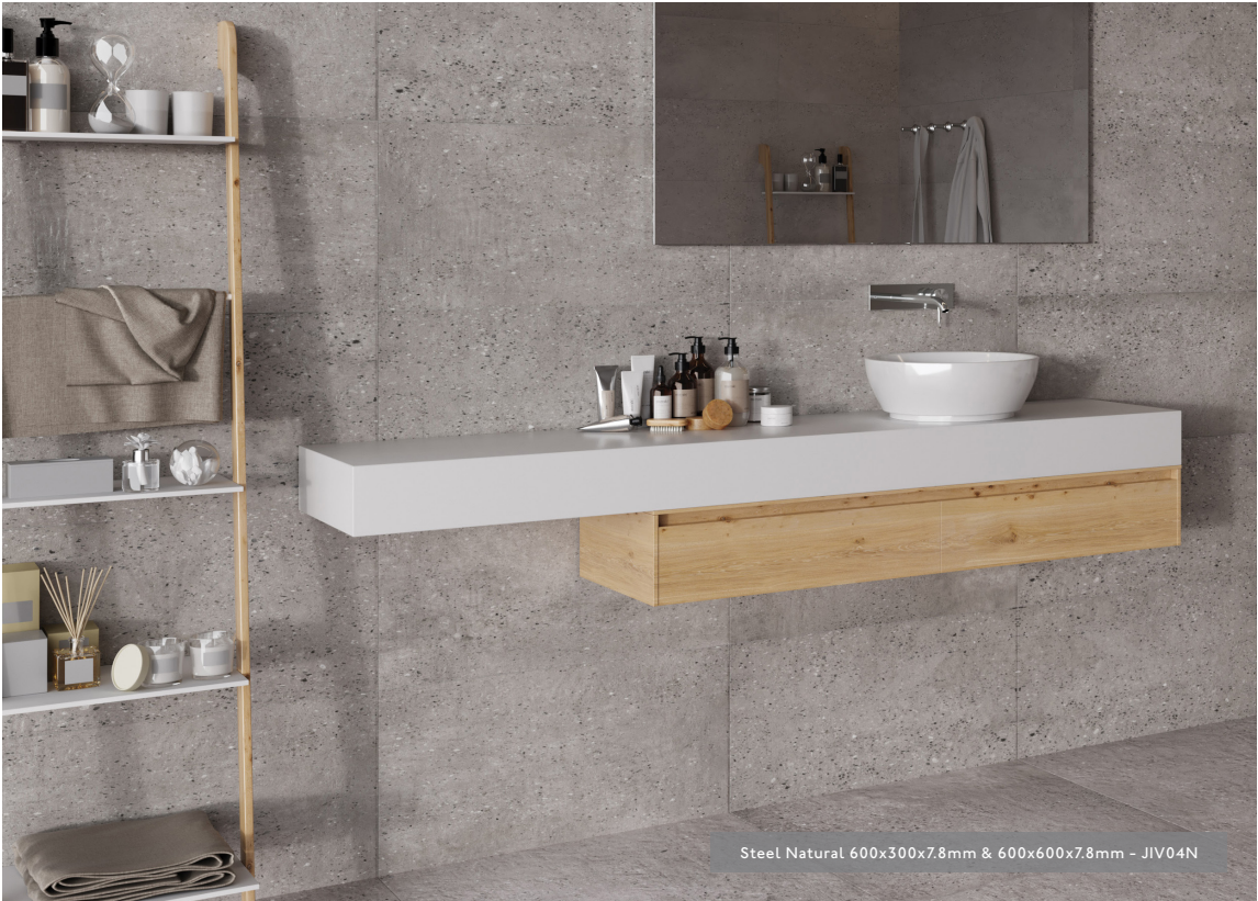
Steel Natural 600x300x7.8mm & 600x600x7.8mm - JIV04N

Note: (R) Rectified Edge. Class Bla: Glazed Porcelain Tiles. For more information please see the suitability advice given in the technical section. All sizes indicated are metric modular. All sizes shown are nominal. For the most up-to-date size, colour and finish availability, please visit our website - www.johnson-tiles.com .