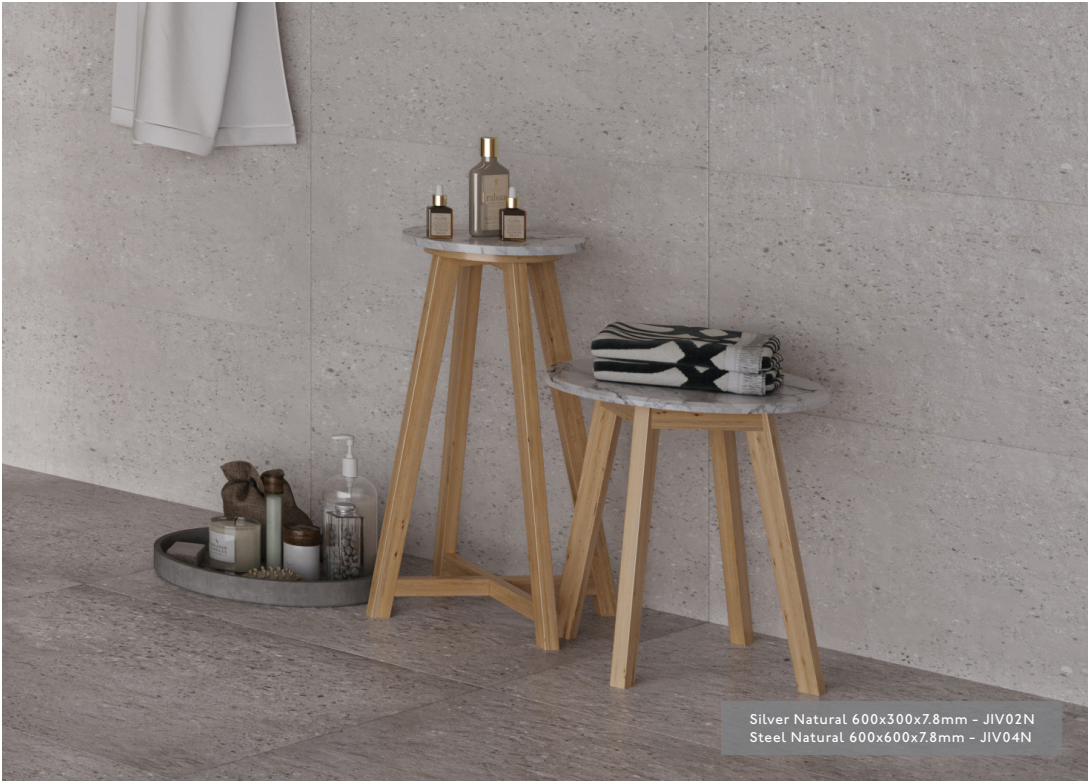
Silver Natural 600x300x7.8mm - JIV02N Steel Natural 600x600x7.8mm - JIV04N