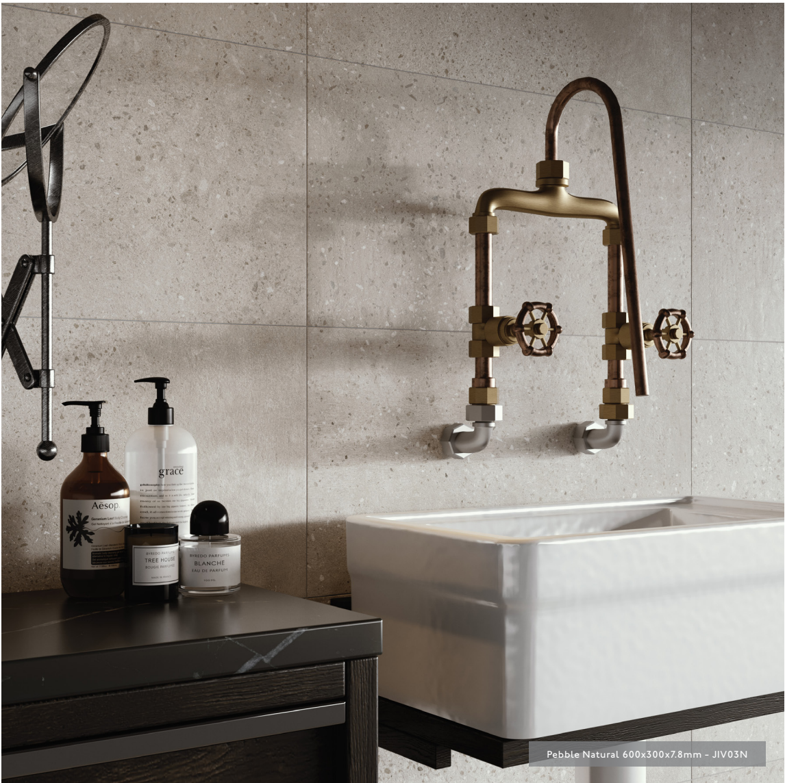
Pebble Natural 600x300x7.8mm - JIV03N