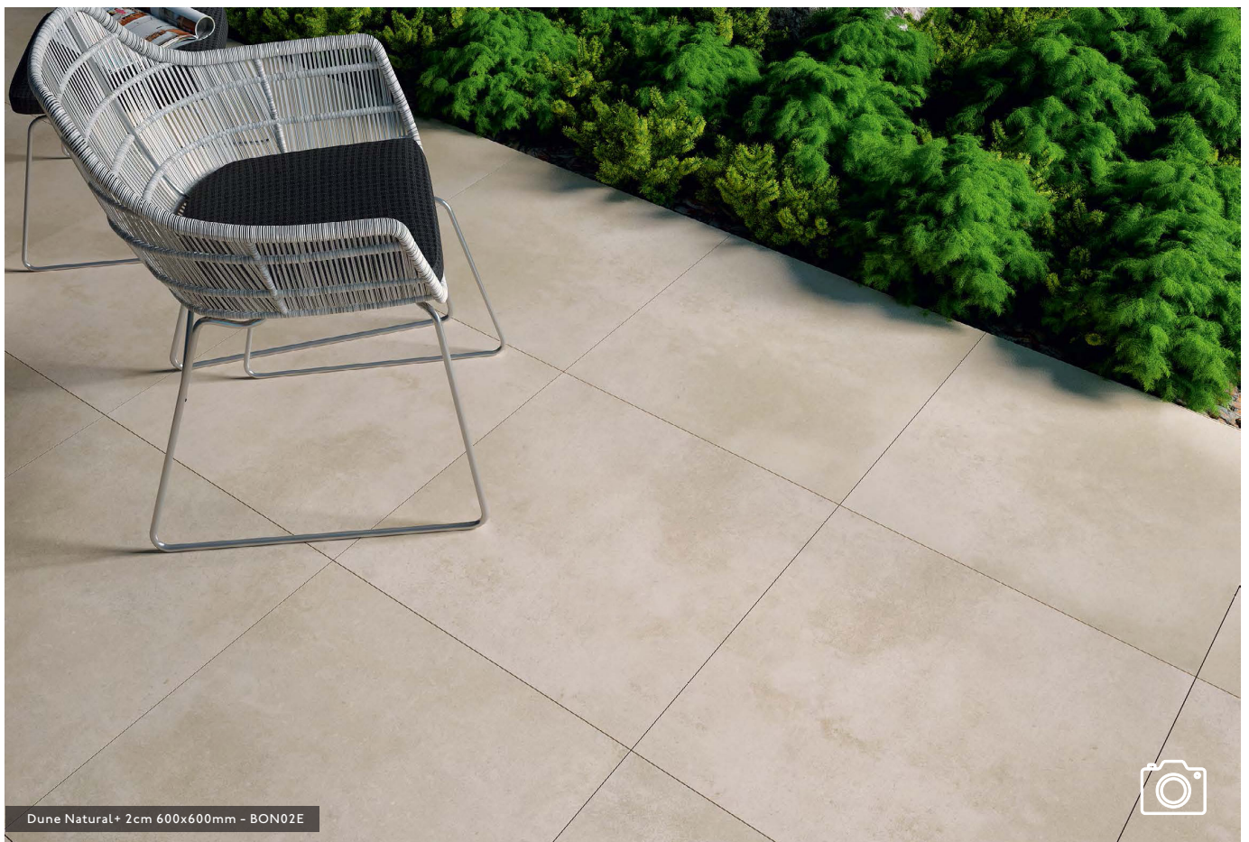
Dune Natural+ 2cm 600x600mm - BON02E

Note: All sizes indicated are metric modular. All dimensions are in millimetres. All sizes shown are nominal. For the most up-to-date availability information, please visit our website. All LRV results are from Johnson Tiles' internal test reports and are to be used for guidance only. LRV: Light Reflectance Value.