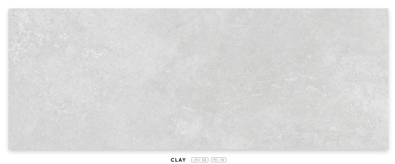
Product Code - 450x450mm [Bla]: M DRWNIF