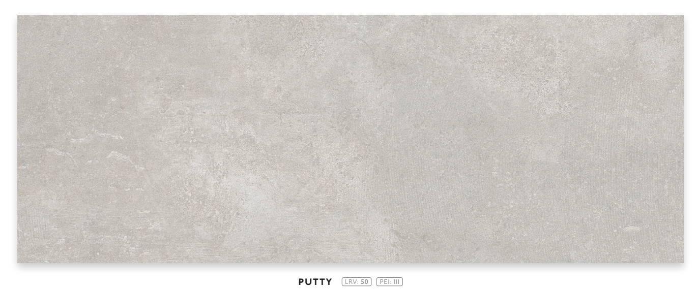
Product Code - 450x450mm [Bla]: M DRWN2F