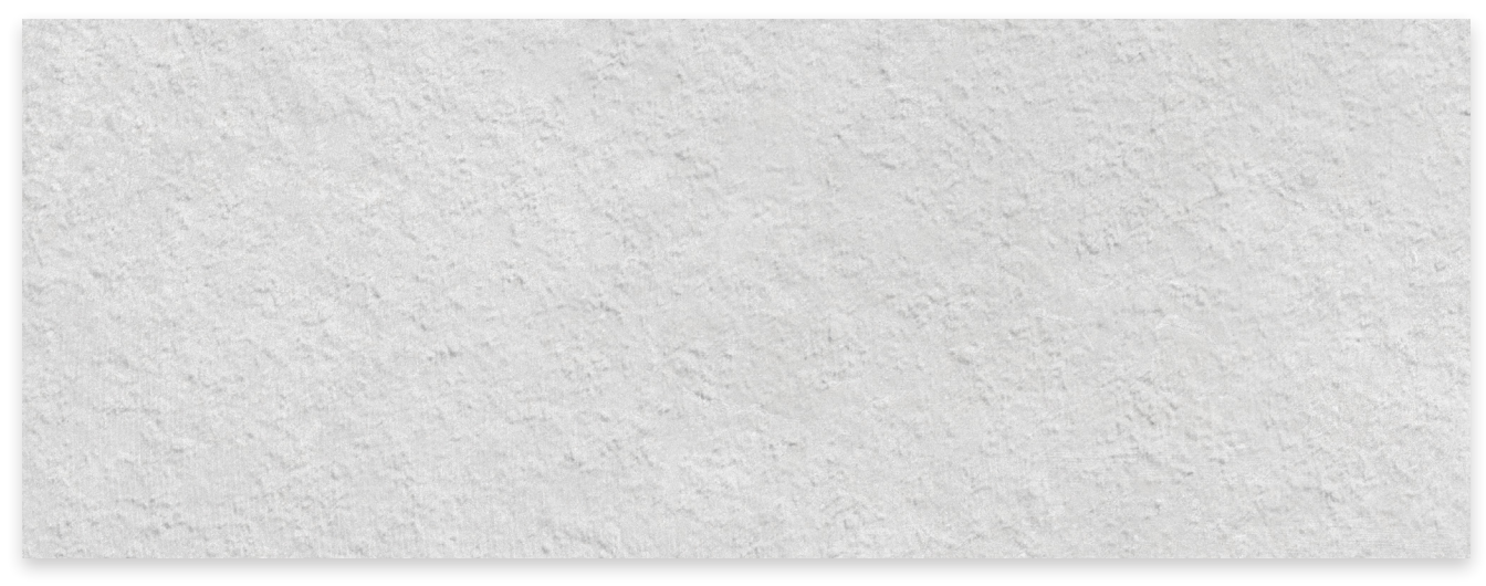
CLAY (Rockfall Structure) [LRV: 55] Product Code - 450x250mm [BIII]: M DRWNIA