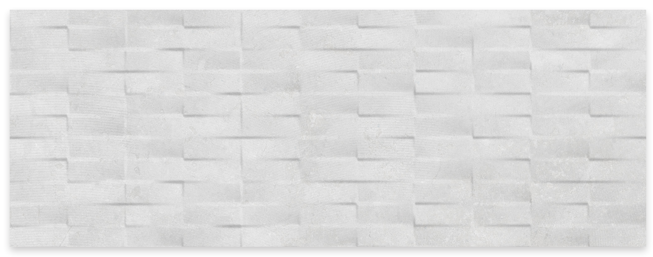
CLAY (Rectangular Structure) LRV: 55 Product Code - 450x250mm [BIII]: M DRWNID