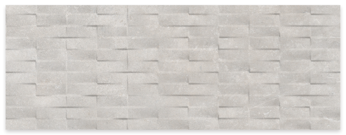
PUTTY (Rectangular Structure) LRV: 50 Product Code - 450x250mm [BIII]: M DRWN2D