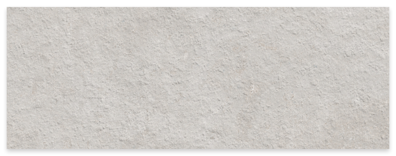
PUTTY (Rockfall Structure) LRV: 50 Product Code - 450x250mm [BIII]: M DRWN2A