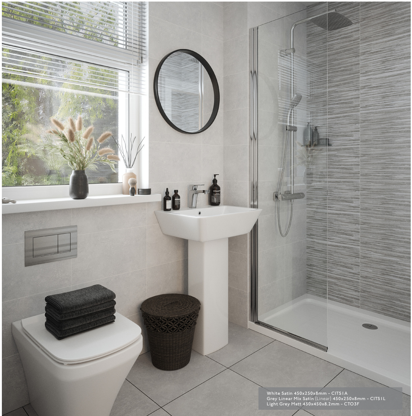
White Satin 450x250x8mm - CITSIA Grey Linear Mix Satin (Linear) 450x250x8mm - CITSIL Light Grey Matt 450x450x8.2mm - CTO3F

The colours shown in this range overview download are as accurate as printing processes will allow. Please refer to actual product samples before specifying. Every effort has been made to ensure the accuracy of the information given.