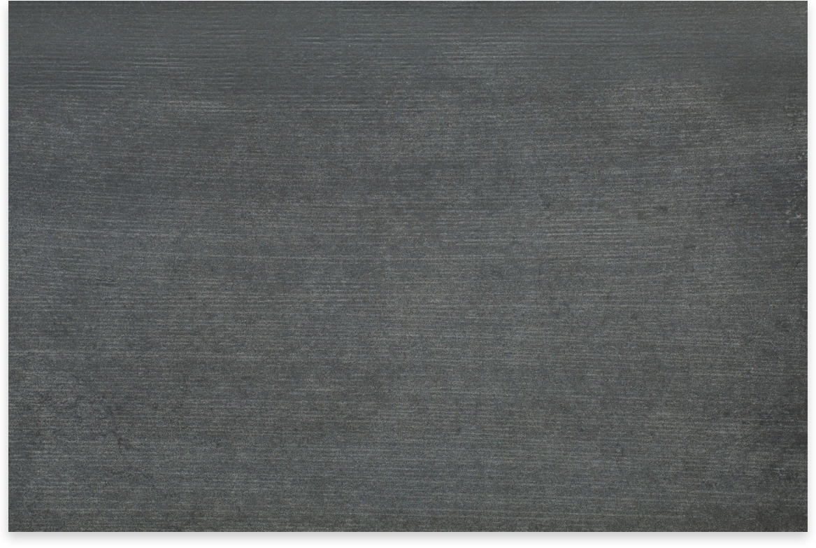
CHARCOAL LRV: 12 PEI: II

Product Code - All Mosaics: N CCR3NM Fitting Code - All Skirtings: N CCR3NS