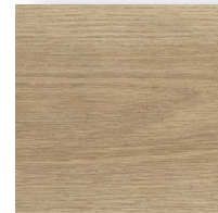
ARN04N Hickory 1200x200mm