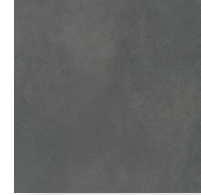
BON05N Storm 600x300mm