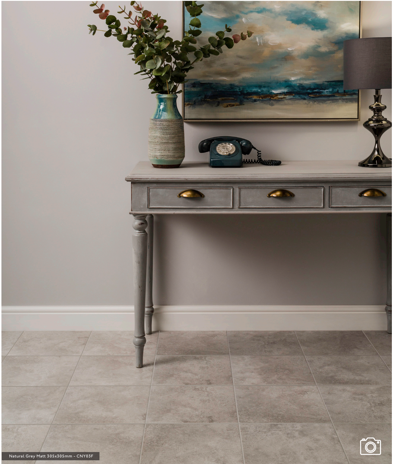
Natural Grey Matt 305x305mm - CNY03F

Front Cover Image: Old Stone Matt 300x200mm - CNY01A, Old Stone Wave Structure Matt 300x200mm - CNY01W & Old Stone Matt 305x305mm - CNY01F