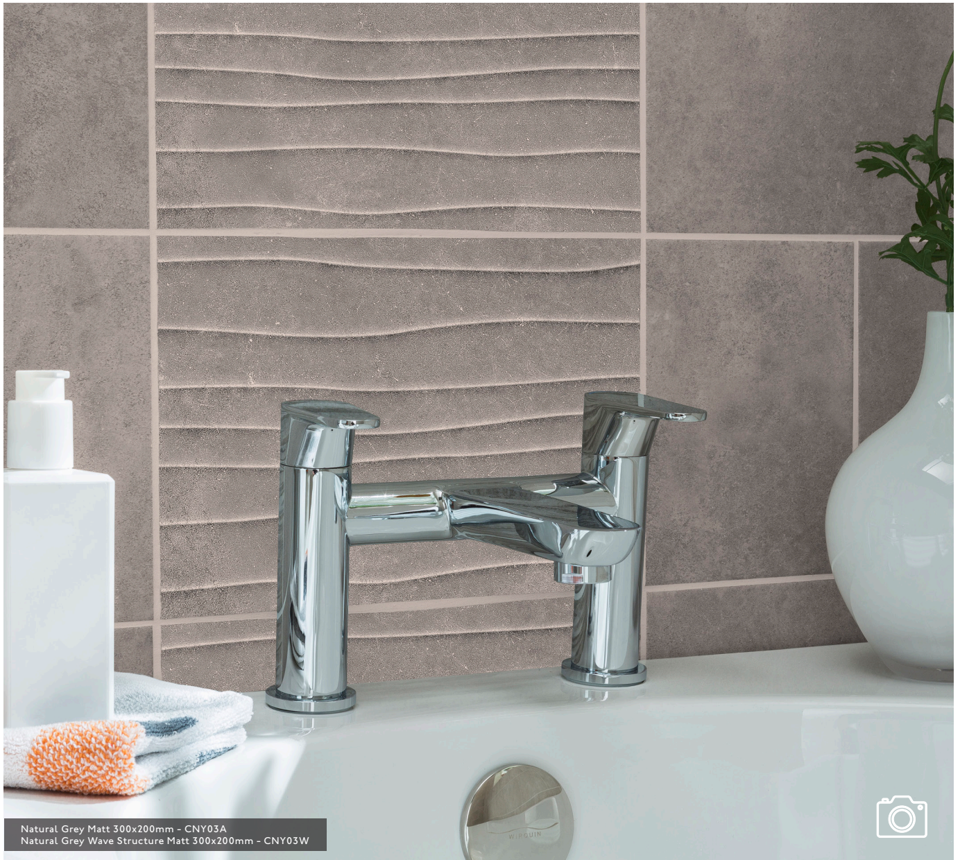
Natural Grey Matt 300x200mm - CNY03A Natural Grey Wave Structure Matt 300x200mm - CNY03W