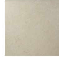
Urbanique URBN1A Stone 360 x 275mm