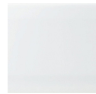
Bevel Brick BVBR1A White 200 x 100mm