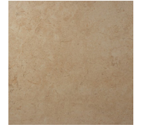
Urbanique URBN2A Honey 360 x 275mm