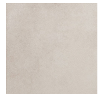
Country Stones COS02A Barley Cream 100 x 100mm