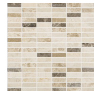
Natural Mosaics SMBB1A Brown & Beige 305 x 305mm