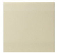
Bevel Brick BVBR2A Cream 200 x 100mm