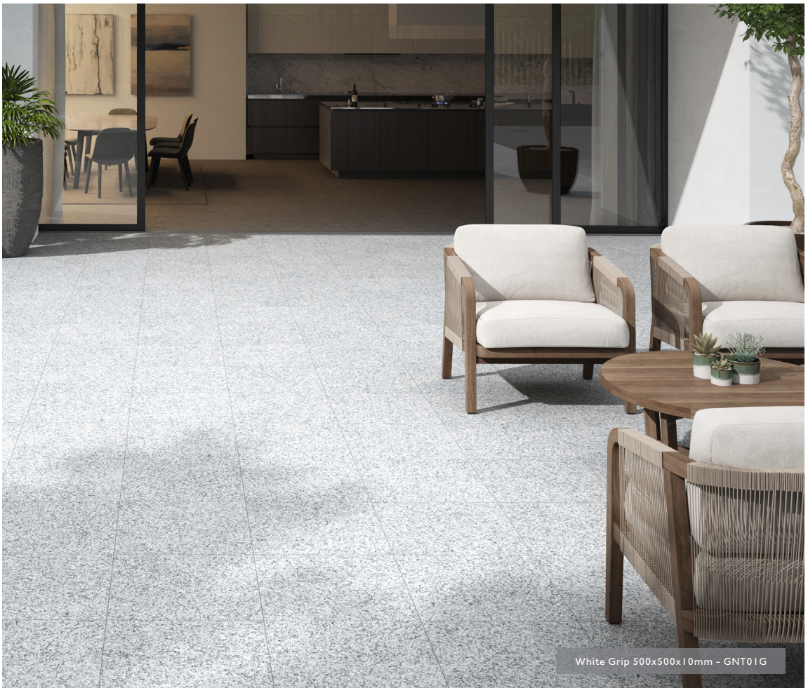
White Grip 500x500x10mm - GNT01G

Note: Class Bla: Glazed Porcelain Tiles. For more information please see the suitability advice given in the technical section. All sizes indicated are metric modular. All sizes shown are nominal. For the most up-to-date size, colour and finish availability, please visit our website - www.johnson-tiles.com .