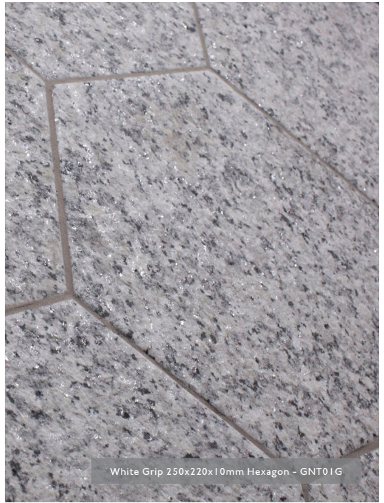
White Grip 250x220x10mm Hexagon - GNT01G