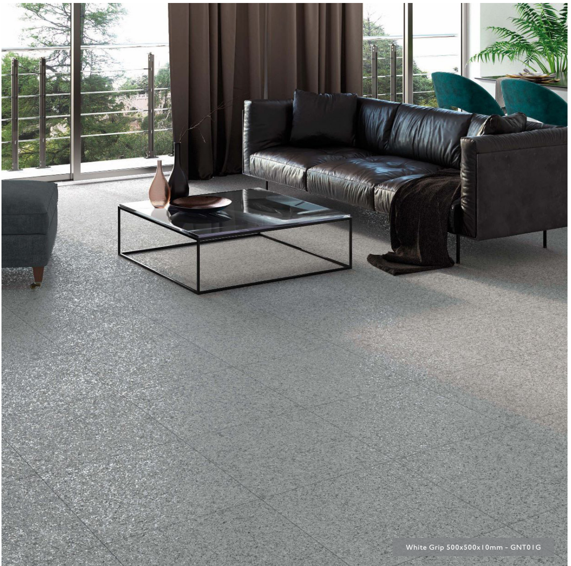
White Grip 500x500x10mm - GNT01G