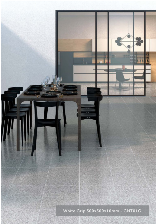
White Grip 500x500x10mm - GNT01G