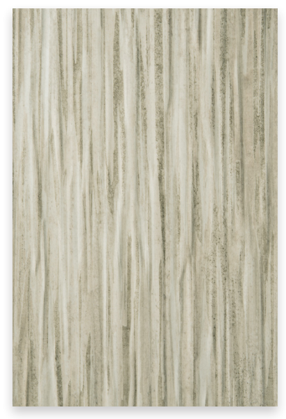
AUTUMN REEDS LINEAR STRUCTURE M DRIFIA LRV: 55