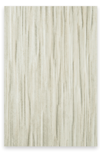
SPRING FROST LINEAR STRUCTURE M DRIF2A LRV: 62