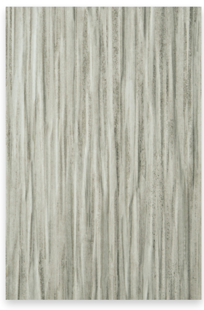
SUMMER SHADOWS LINEAR STRUCTURE M DRIF3A LRV: 40