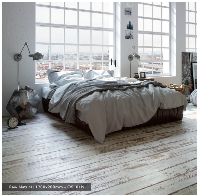
Raw Natural | 200x200mm - OSLO1N