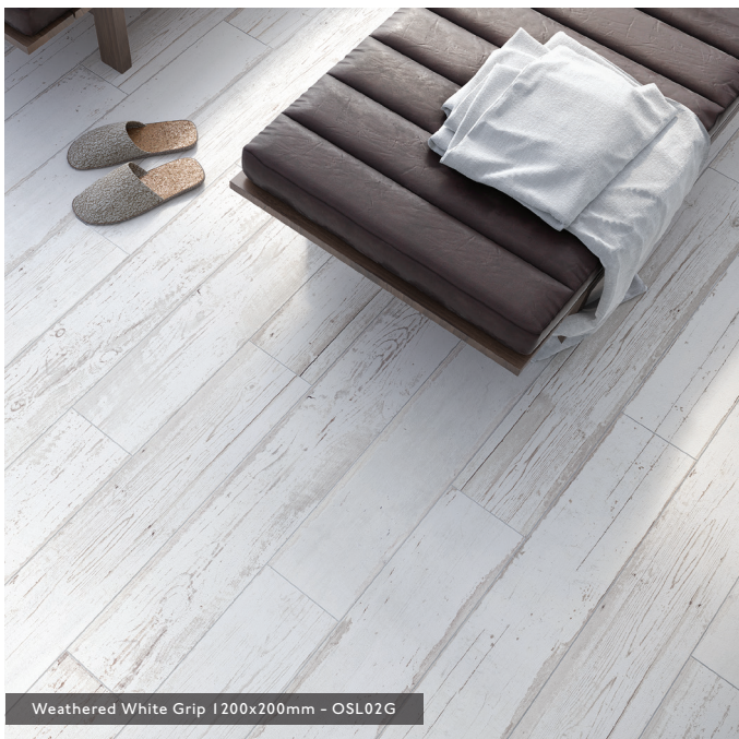
Weathered White Grip | 200x200mm - OSLO2G