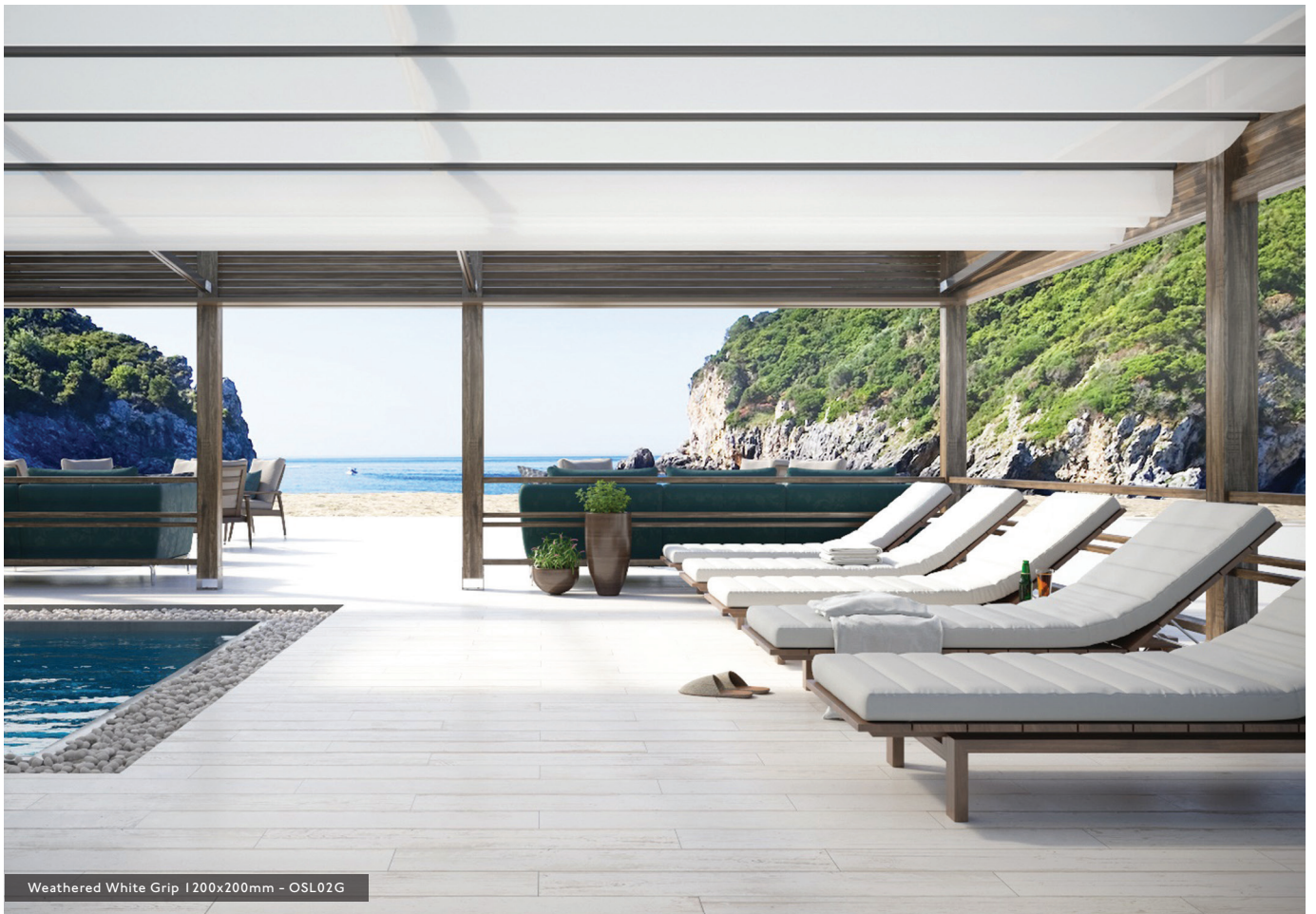
Weathered White Grip 1200x200mm - OSL02G

Note: All sizes indicated are metric modular. All dimensions are in millimetres. All sizes shown are nominal. For the most up-to-date availability information, please visit our website. All LRV results are from Johnson Tiles' internal test reports and are to be used for guidance only. LRV: Light Reflectance Value.