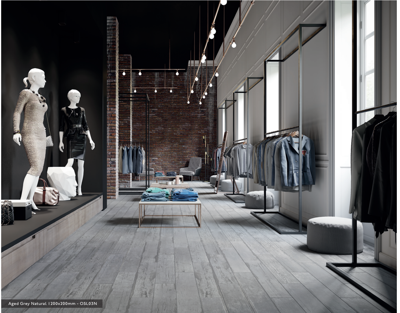
Aged Grey Natural | 200x200mm - OSLO3N