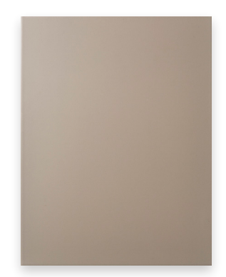
SAND G STUD3G + S STUD3S LRV: 40