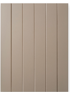
S STUD3E LRV: 40