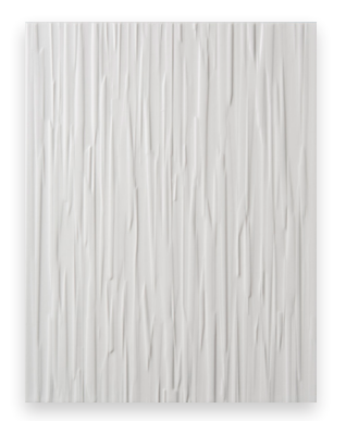
TUNDRA LINEAR STRUCTURE S TUND2L LRV: 83