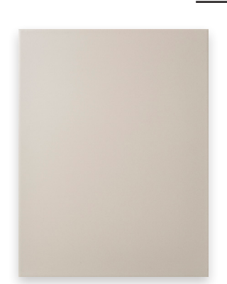
HAZE G STUD2G + S STUD2S LRV: 63