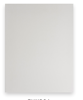
TUNDRA G TUNDIA + S TUND2A LRV. 83