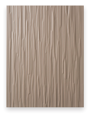
SAND LINEAR STRUCTURE S STUD3L LRV: 40