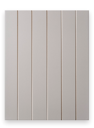
MIST SCORED S STUD4E LRV: 42