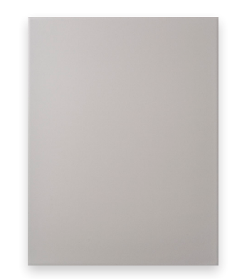
MIST G STUD4G + S STUD4S LRV: 42