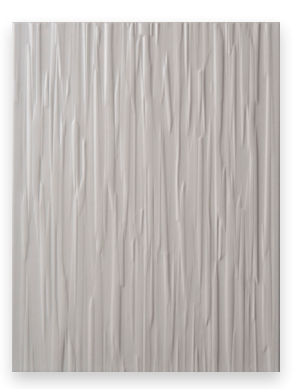
MIST LINEAR STRUCTURE S STUD4L LRV: 42