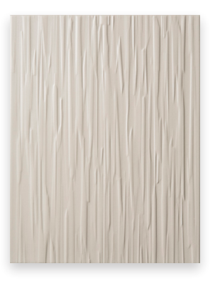
HAZE LINEAR STRUCTURE (S) STUD2L (LRV: 63)