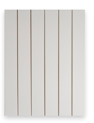
TUNDRA SCOREDS TUND2ELRV: 83