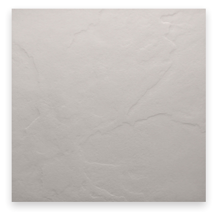
WHITE ROCK STRUCTURE M LAGO4F PEI: IV LRV: 64