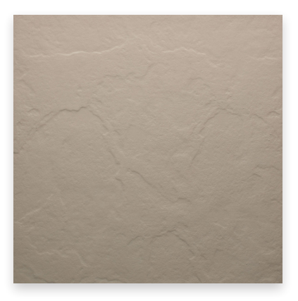
BEIGE ROCK STRUCTURE M LAGO5F PEI: III LRV: 54