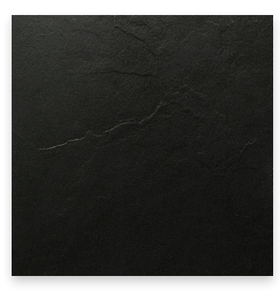
BLACK ROCK STRUCTURE M LAGO2F PEI:1 LRV: 6