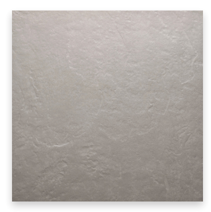
LIGHT GREY ROCK STRUCTURE M LAGO3F PEI: II LRV: 29