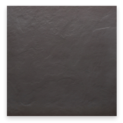
DARK GREY ROCK STRUCTURE M LAGOIF PEI:1 LRV: 13