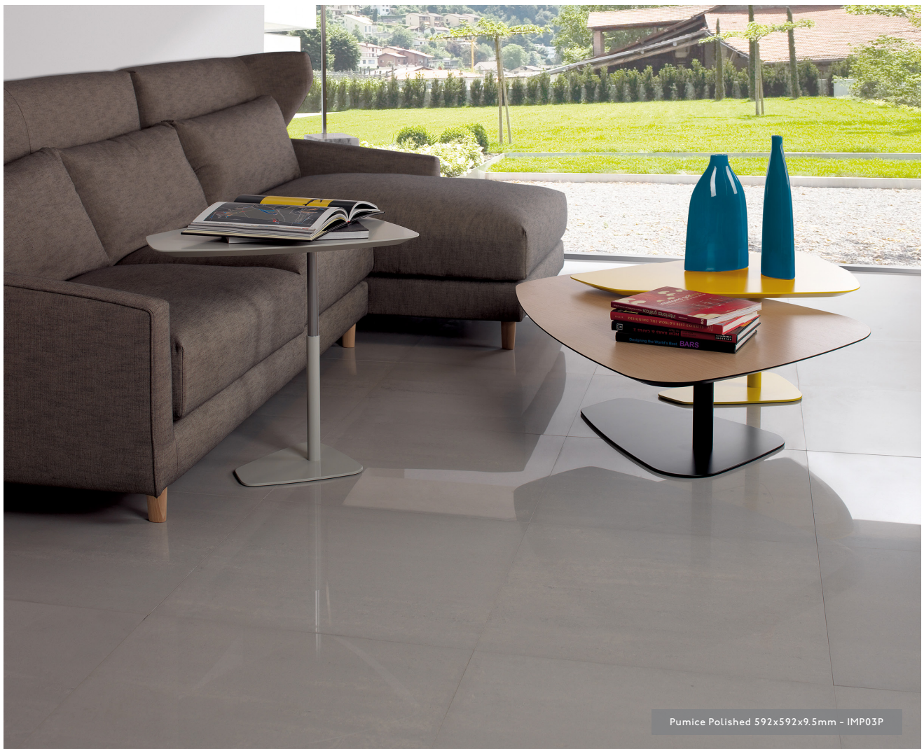
Pumice Polished 592x592x9.5mm - IMP03P

Note: All sizes indicated are metric modular. All sizes shown are nominal. (R) Rectified Edge. For the most up-to-date product availability information for this range, please visit our website - www.johnson-tiles.com