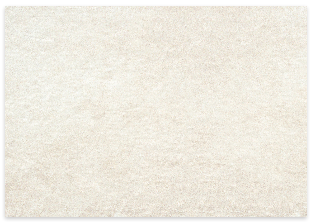
CHALK (LRV: 54) (PEI: IV) Product Code - All Sizes: N ZEYOIN Product Code - I 200x600mm & 745x745mm: G ZEYOIG