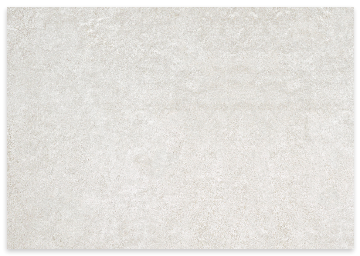
LIGHT GREY LRV:55 PEI: IV Product Code - All Sizes: N ZEY02N Product Code - I 200x600mm & 745x745mm: G ZEY02G