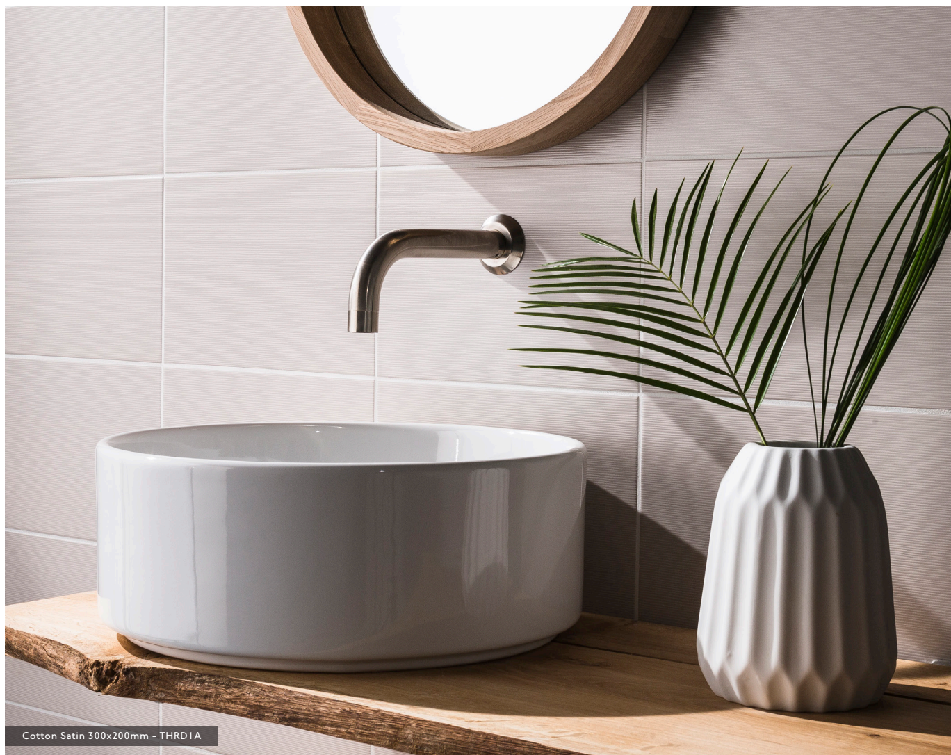
Cotton Satin 300x200mm - THRD1A