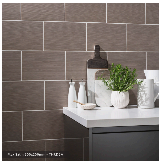
Flax Satin 300x200mm - THRD3A