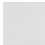
Mode MOD01N Cotton 600 x 600mm