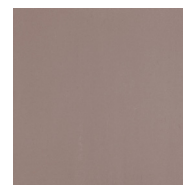
Mode MOD03N Straw 600 x 600mm