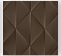
SAV04D Caraway 300x100mm