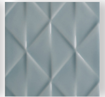
SAV08D Leaf 300x100mm