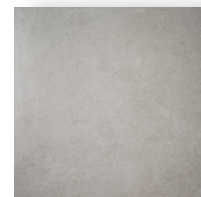
NTS04F Zinc 600x600mm