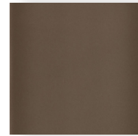
SAV04A Caraway 300x100mm