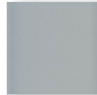
SAV08A Leaf 300x100mm