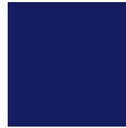
Bespoke Tiles Dark Blue 225 x 76mm