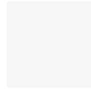
Bespoke Tiles White 225 x 76mm