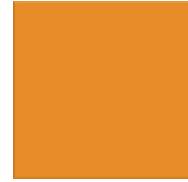
Prismatic PRG55 Pumpkin 100 x 100mm