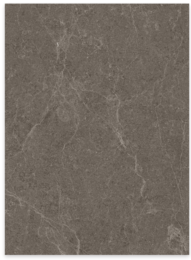
SAND [LRV: 62] Product Code: M DAKOIA