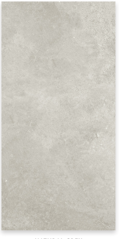
NATURAL GREY M CAB03A LRV: 50