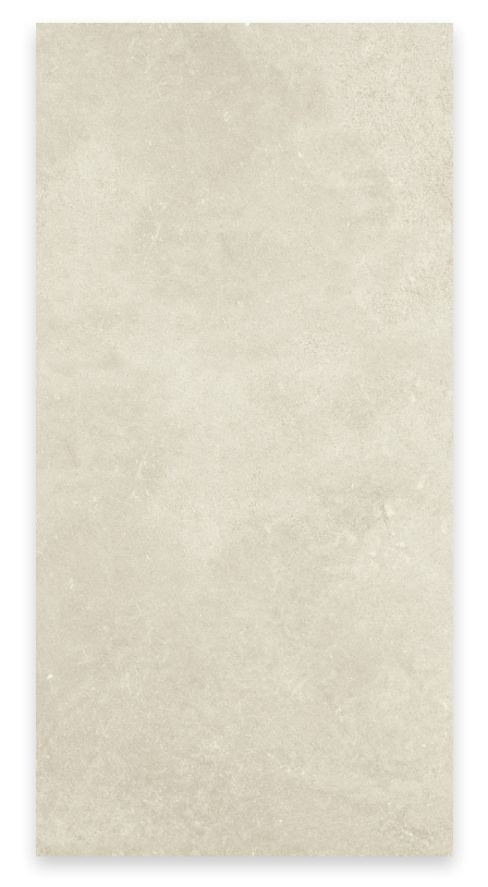
OLD STONE M CABOIA LRV: 53