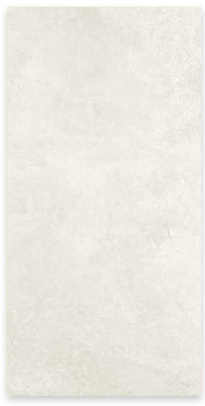
CLASSIC WHITE M CAB02A LRV: 73