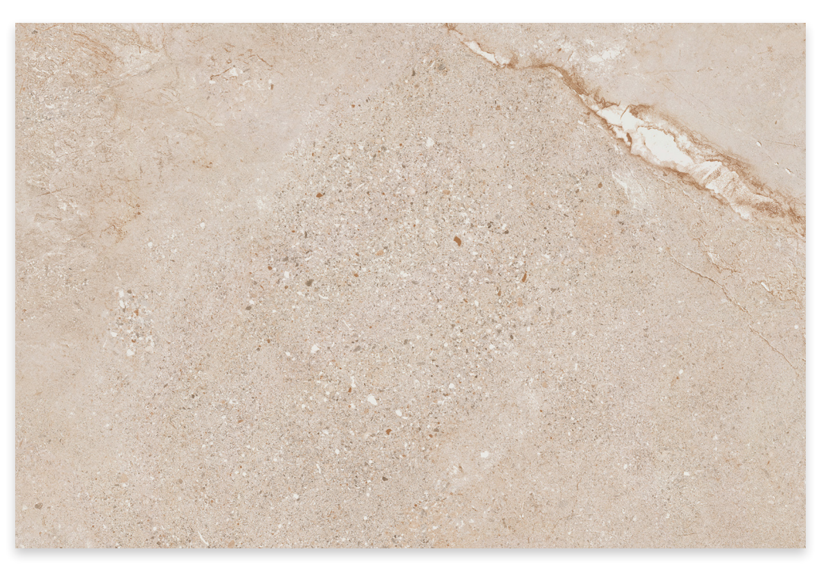
IVORY LRV: 53 PEI: IV

Product Code - All Sizes: N YAROIN | Product Code - 600x600mm & 600x300mm: G YAROIG