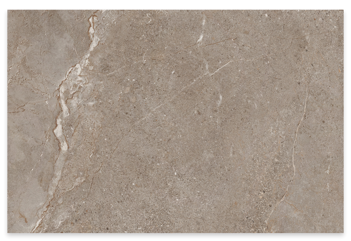
SILVER LRV: 32 PEI: IV

Product Code - All Sizes: N YAR03N Product Code - 600x600mm & 600x300mm: G YAR03G