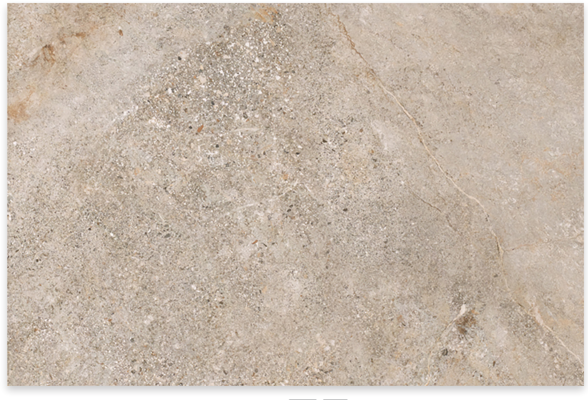
PEBBLE LRV: 42 PEI: IV

Product Code - All Mosaics: N YARINM Fitting Code - All Skirtings: N YARINS