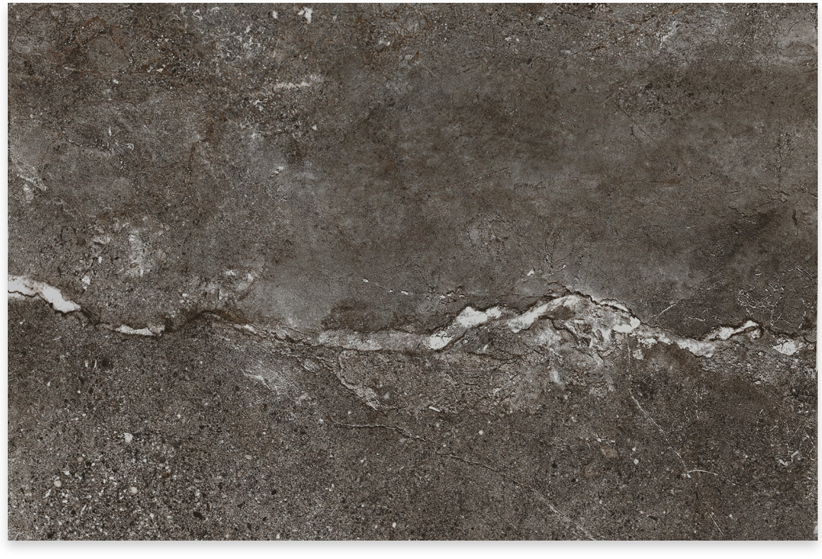
CARBON LRV: 15 PEI: III

Product Code - All Mosaics: N YAR3NM Fitting Code - All Skirtings: N YAR3NS