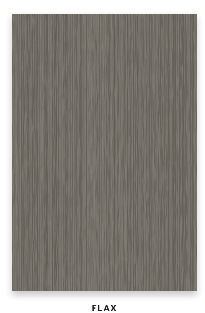
S THRD3A LRV: 12