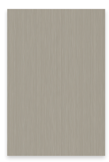
TAUPE S THRD2A LRV: 31