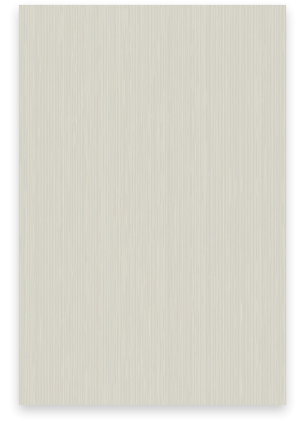
COTTON S THRDIA LRV: 62