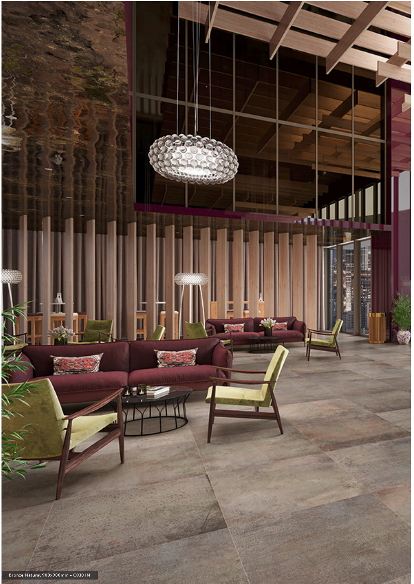
Bronze Natural 900x900mm - OXI01N