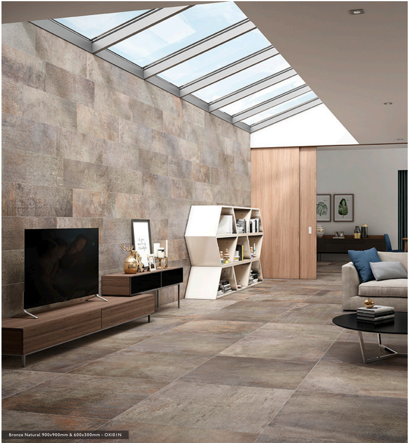
Bronze Natural 900x900mm & 600x300mm - OX101N

Oxide is a glazed porcelain range that delivers an industrial look perfect for modern design schemes. Three available colours include Light Grey, Dark Grey, and Bronze, each showcasing the patina effect of rusted metal. With large format sizes ranging from 600x600mm up to 900x900mm and a PTV slip resistance rating of 36+, Oxide adds character and performance to any installation.